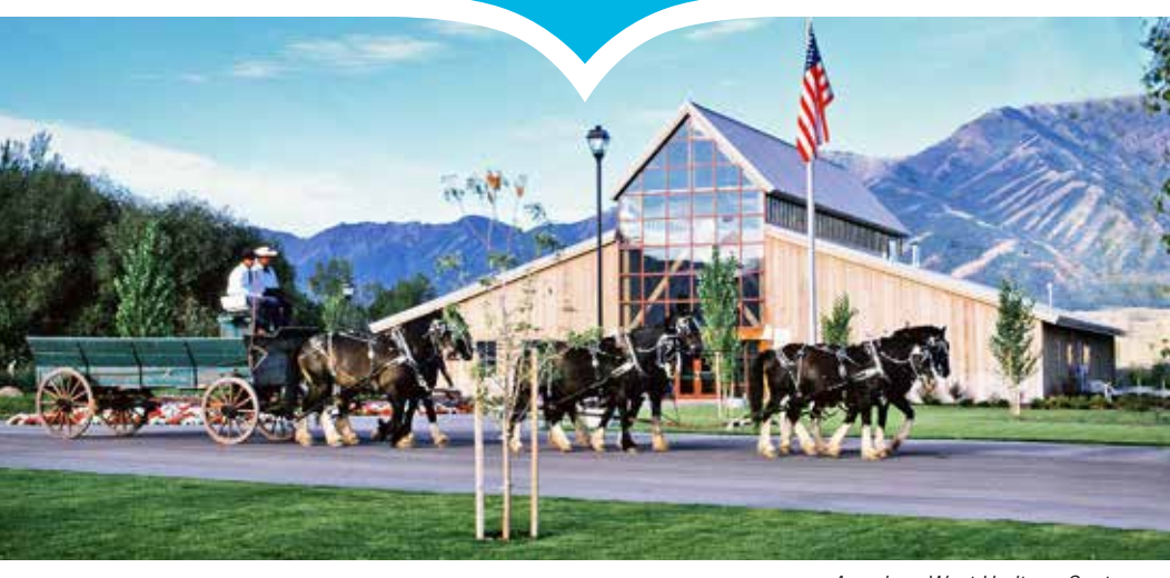
American West Heritage Center