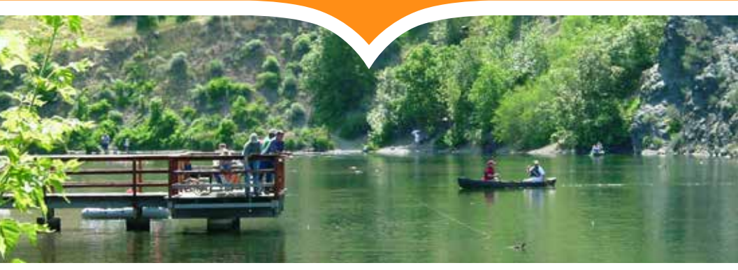
First Dam in Logan Canyon