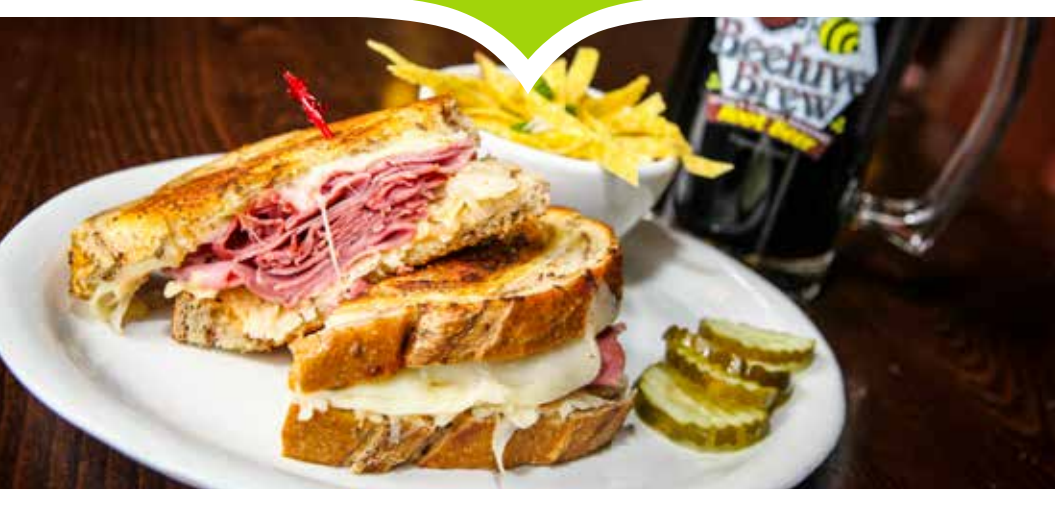
The Beehive Grill