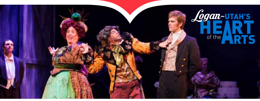
Utah Festival Opera & Musical Theatre