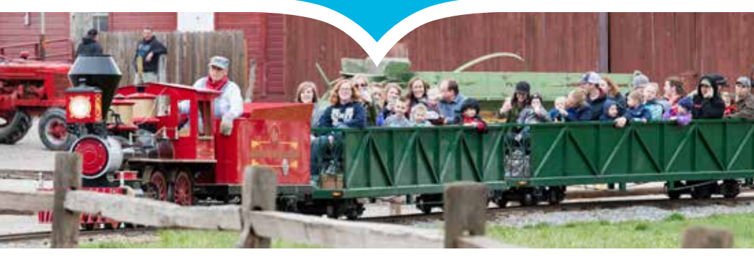
American West Heritage Center