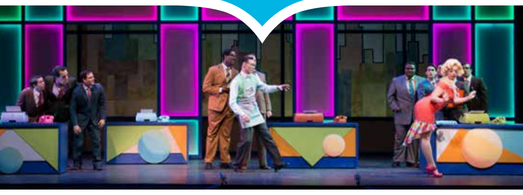
Utah Festival Opera & Musical Theatre

Logan's Freedom Fire Celebration and Fireworks Show, (held July 3rd), (435) 716-9250, loganutah.org. A patriotic celebration with spectacular fireworks and live performances.