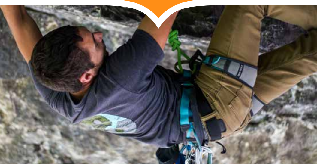
Rock Climbing in Logan Canyon