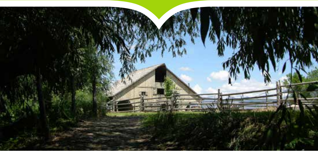
American West Heritage Center